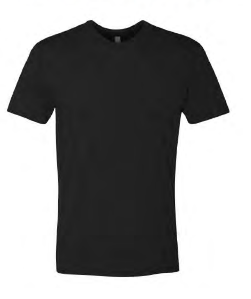
SOFT BLEND TEE

COLOR OPTIONS: CLICK HERE TO VIEW COLOR OPTIONS