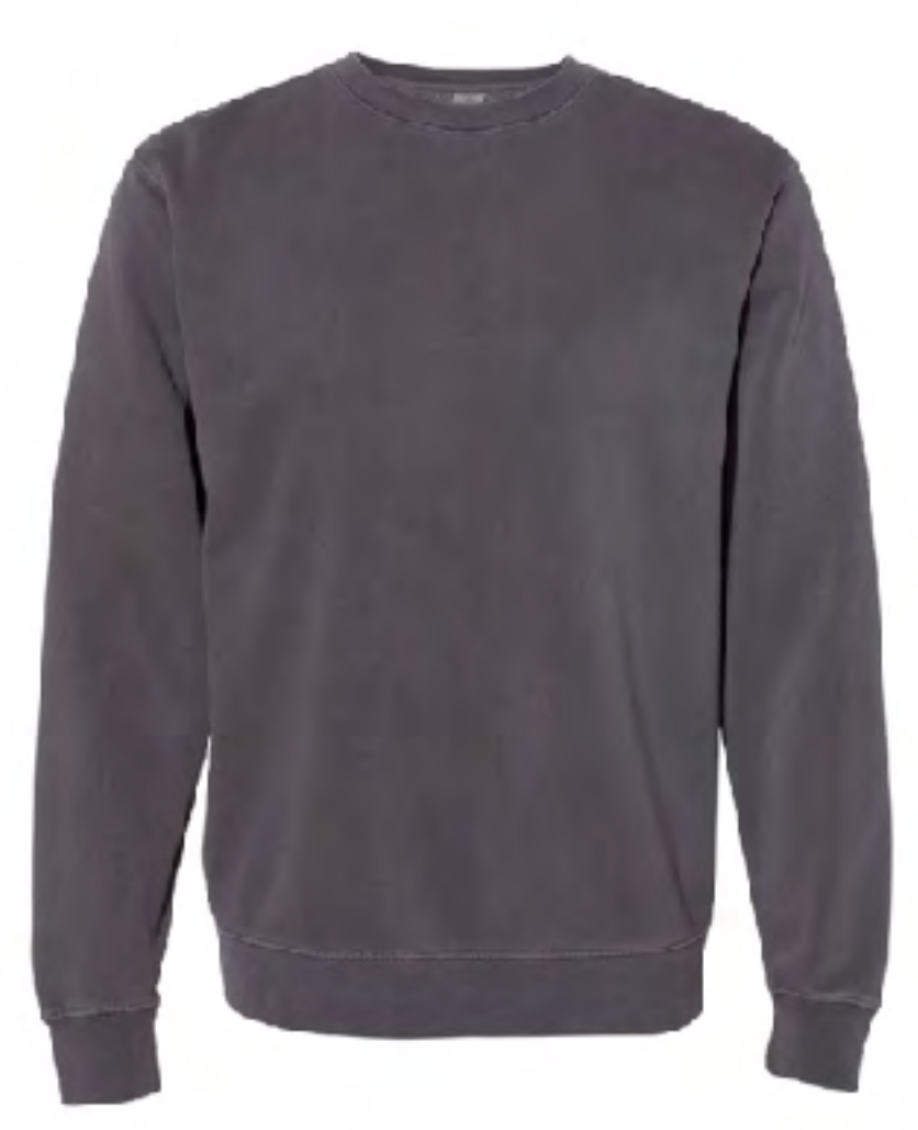
COLOR OPTIONS: CLICK HERE TO VIEW COLOR OPTIONS