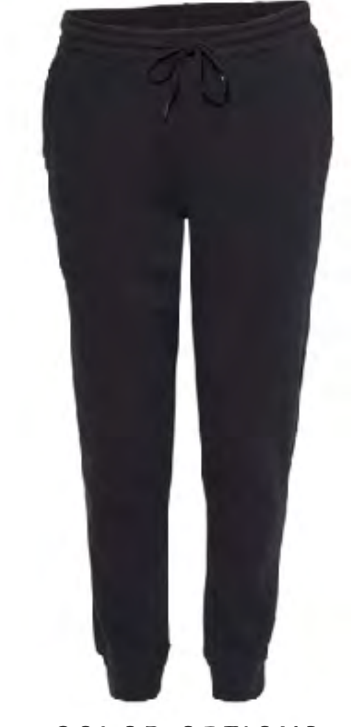
COLOR OPTIONS: CLICK HERE TO VIEW COLOR OPTIONS